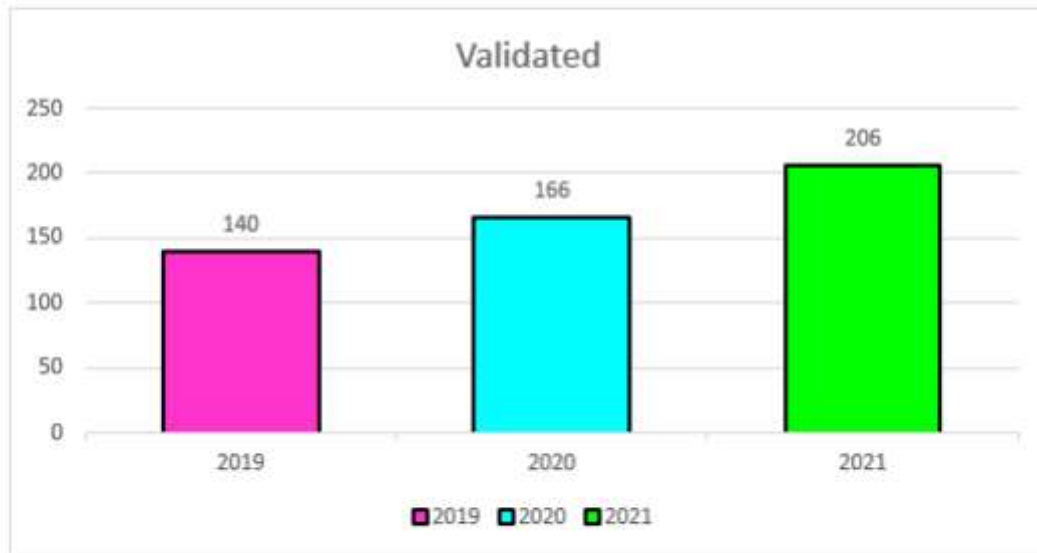
Premiers Reading Challenge 2019-21

206 students completed the Premier's Reading Challenge this year. This is an increase of almost 20% from last year. Well done everyone for completing the challenge during this difficult year.