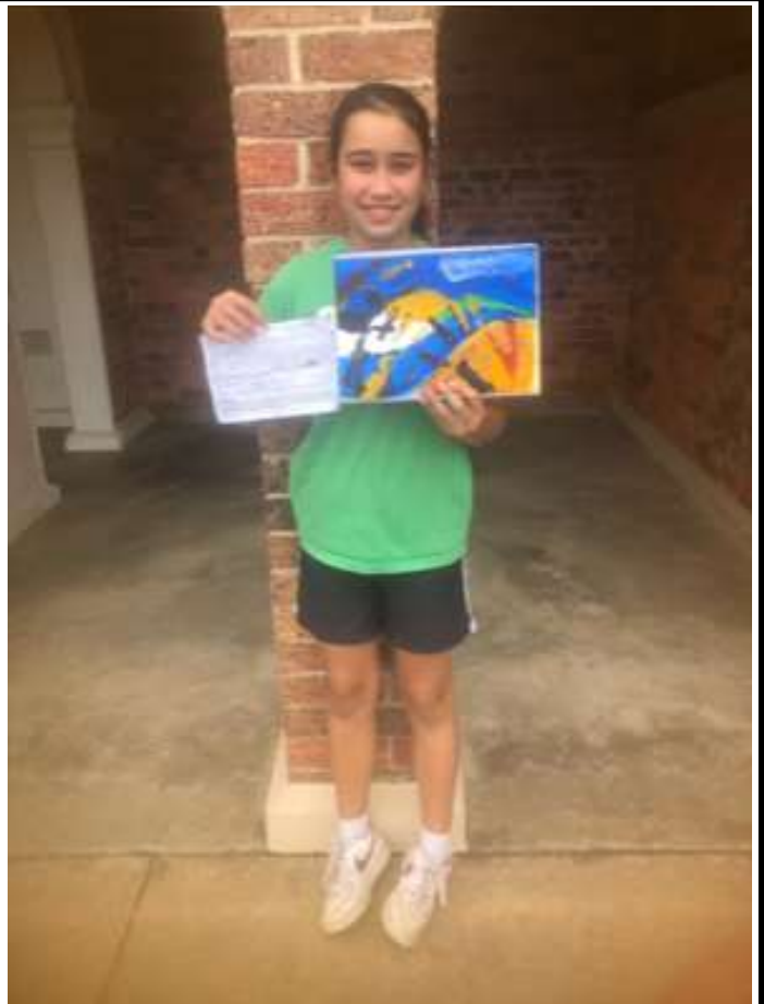
Our Mob, Your Mob, My Mob.

My artwork 'River Connections – Bega River' represents my mob's connection to the Bega River. I feel connected to the Bega River because it has a long history with my mob. I enjoy spending time swimming in the river and listening to my dad tell stories about it.